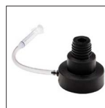
A00000135 Sensor check