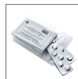
A00000136 Control Test tablets