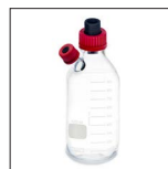
A00000410 Denitrification glass bottle