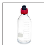
A00000419 Kit plastic biodegradability analysis